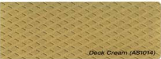
Deck Cream (AS1014)