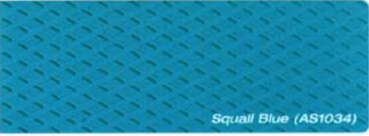
Squall Blue (AS1034)