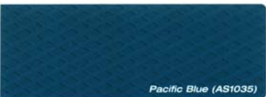
Pacific Blue (AS1035)