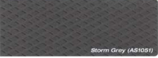
Storm Grey (AS1051)